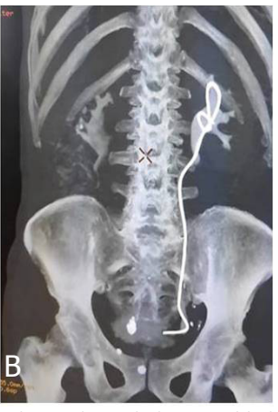
Figure 2: (A) Right hydronephrotic kidney with left perinephric collection(urinoma) with overdistended urinary bladder. (B) Decompressed urinary bladder with left DJ stent in situ.