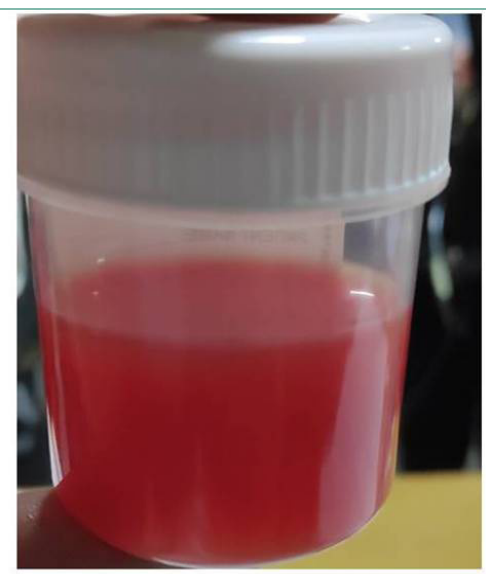
Figure 5: Aspiration of perinephric fluid show hemorragic fluid with creatine level 23 mg/dl.

Our patient had right hydronephrosis and left perinephric fluid collection i.e. urinoma secondary to overdistended urinary bladder as a result of prostatic obstruction. Right Kidney had thin parenchyma compared to left kidney at presentation. This was mainly as a result formation of left urinoma venting off increased pressure in left pelvicalyceal system. The release of urine from left renal pelvis leads to preservation of parenchyma as well leading to symptoms.