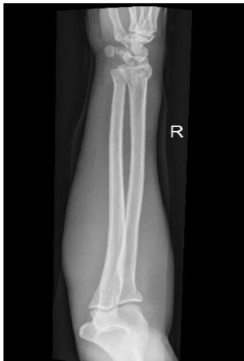
Figure 3: Impacted proximal radial neck and head fracture and distal intraarticular fracture of the radius and ulnar styloid avulsion fracture.