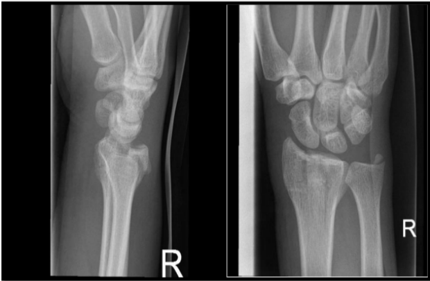
Figure 1: Comminuted distal radial intraarticular fracture with ulnar styloid process fracture.