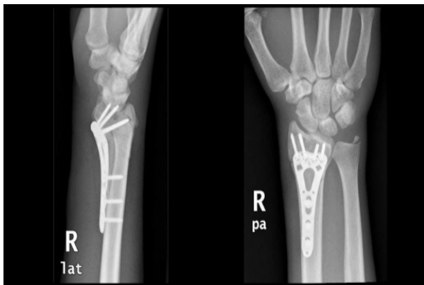
Figure 9: Plate and screws applied to the distal radius to stabilize the fracture.

Orthopaedics on-call assessed the patient, and he was admitted for open reduction and internal fixation of the distal radius fracture through plate and screws (Figure 9). The ulnar styloid and radial head fractures were treated conservatively.