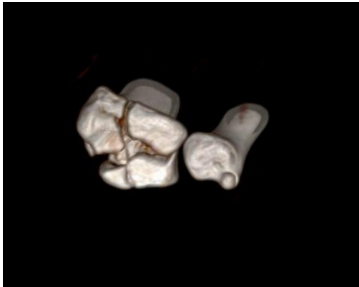
Figure 8: 3D Reconstructed CT of the distal radius and ulna.

Orthopaedics on-call assessed the patient, and he was admitted for open reduction and internal fixation of the distal radius fracture through plate and screws (Figure 9). The ulnar styloid and radial head fractures were treated conservatively.