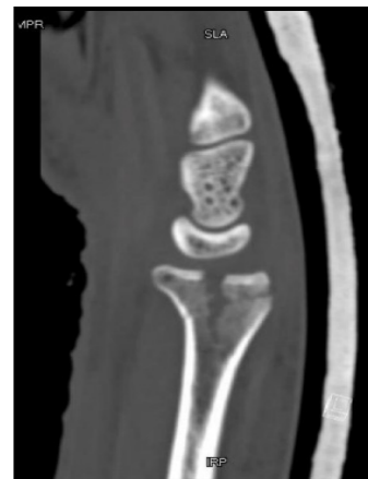
Figure 6: Lateral view of the radial intra-articular fracture.