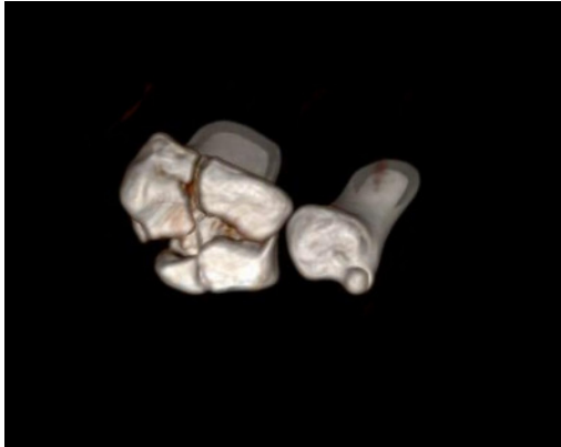
Figure 8: 3D Reconstructed CT of the distal radius and ulna.

Orthopaedics on-call assessed the patient, and he was admitted for open reduction and internal fixation of the distal radius fracture through plate and screws (Figure 9). The ulnar styloid and radial head fractures were treated conservatively.