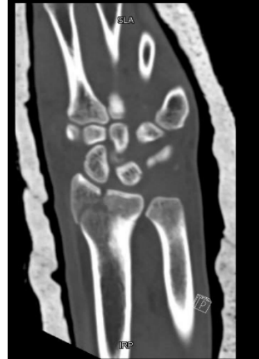
Figure 4: Displaced intra-articular distal radial fracture.