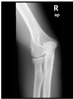
Figure 2: Radial head and neck fracture of the ipsilateral elbow.