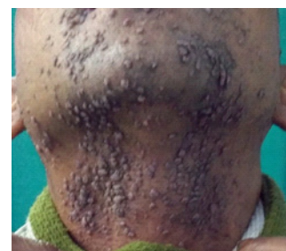
Figure 6: Raer case of warts on beard area in young man.