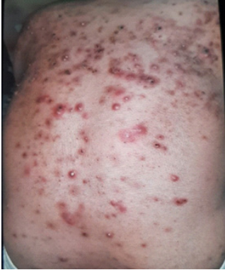
Figure 9: Acute pustulosis (After viral fever) in 27 years old man.