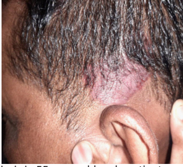
Figure 8: Psoriasis in 55 years old male patient.