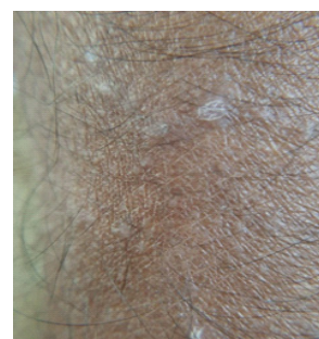
Figure 7: Chronic itching and eruption on arms.