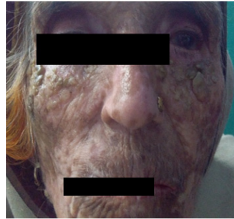
Figure 2: Psoriatic plaques on the face of 78 year old female.