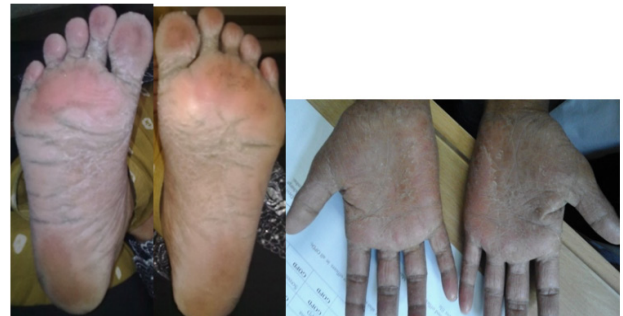
Figures 3 & 4: Fungal infection in hands and feet- 50 year old female patient.