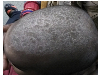
Figure 5: Tinea capitis in 5 years old child Image.