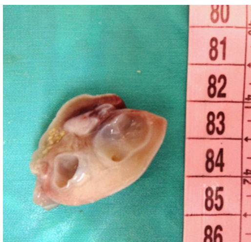
Figure 3: Macroscopic examination of the section of the cyst showing cartilage inclusions and mucosal compartments.

They are generally unilocular, filled with mucus and their wall is multilayered containing components of the airways: Cartilage, smooth muscle, mucous glands and ciliated respiratory epithelium [3]. Prenatal ultrasound can easily detect a unilocular cyst located in the mediastinum, the thorax or the neck area, filled with anechoic fluid and surrounded by a well-defined thin wall [3]. However, research revealed the possibility of bronchogenic cysts presenting as hyperechoic lesions [4]. The principal threats to the fetus that can occur in cases of large cysts include heart compression and lung compression causing secondary parenchymal hypoplasia with the progressive bronchial obstruction, as reported by D. Levine et al. [5]. The evaluation of these risks has motivated the interdisciplinary decision of pregnancy interruption in our case. In the majority of cases, bronchogenic cysts are asymptomatic in the post-natal period. When they are symptomatic, they manifest through repeated bronchopulmonary infections and airway obstruction [6].