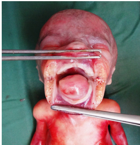
Figure 2: Macroscopic examination of the fetus showing the cyst at the base of the tongue.